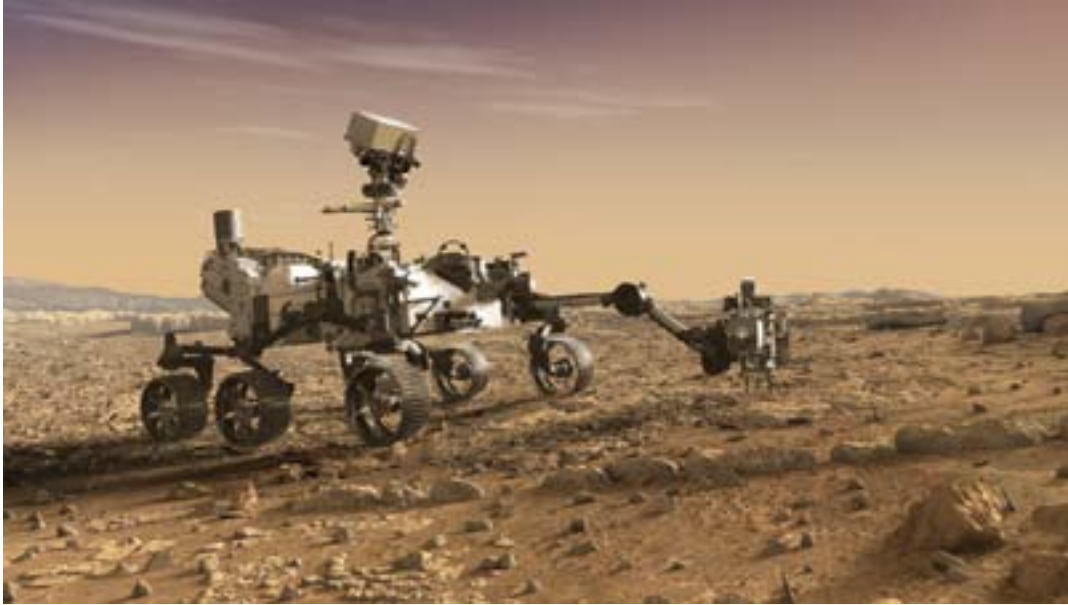
Perseverance inspects a cluster of interesting Martian rocks with its instruments in this artist rendering by NASA JPL/Caltech