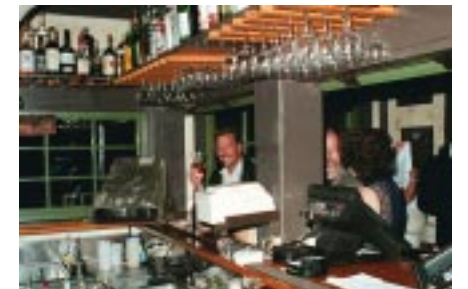
At the Bar: We broke all records surpassing our minimum bar bill by 300%. Good job!!